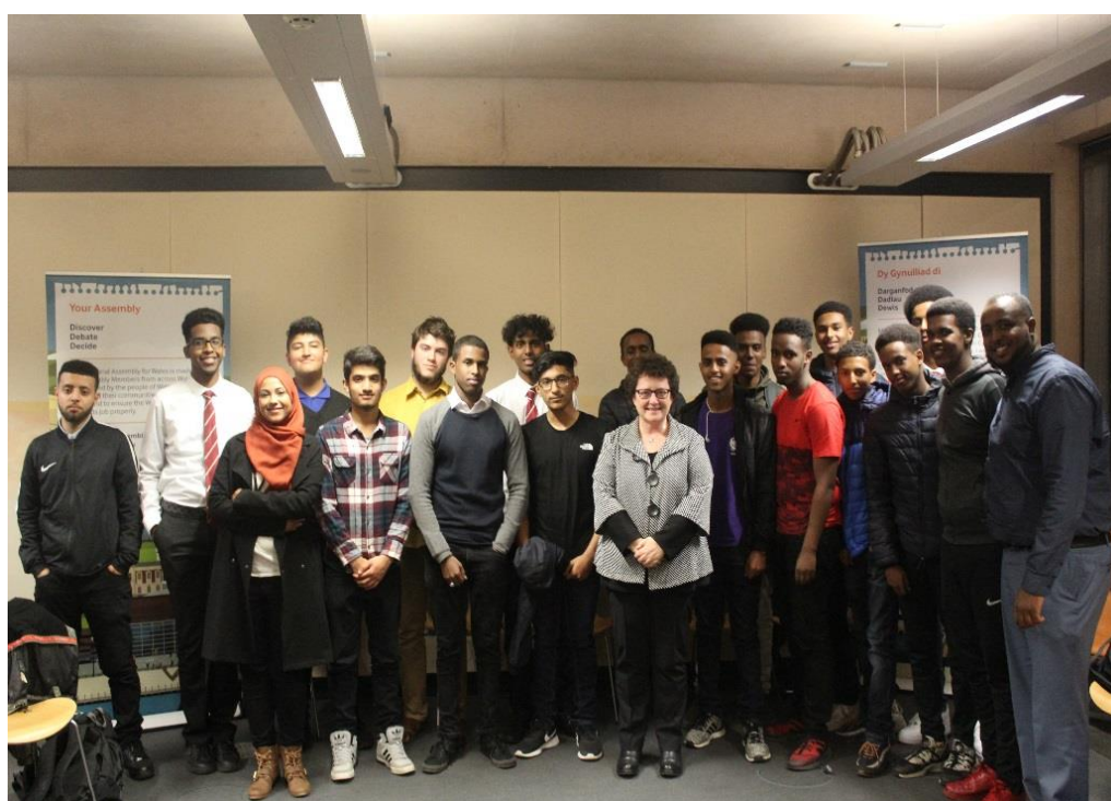
The Llywydd, Elin Jones AM welcoming local students to the Assembly as part of Black History Month