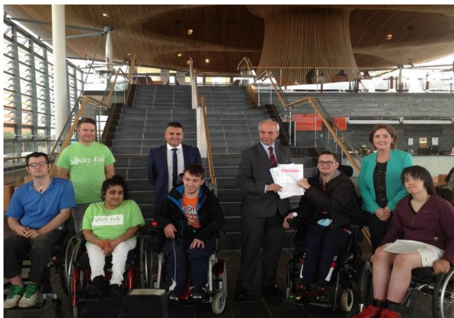
Whizz-Kidz submitting a petition to the Assembly, following a youth engagement workshop in Cardiff